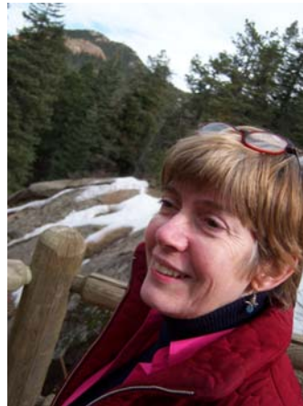
Photo taken in Colorado after the MTNA National Conference in Denver 2008